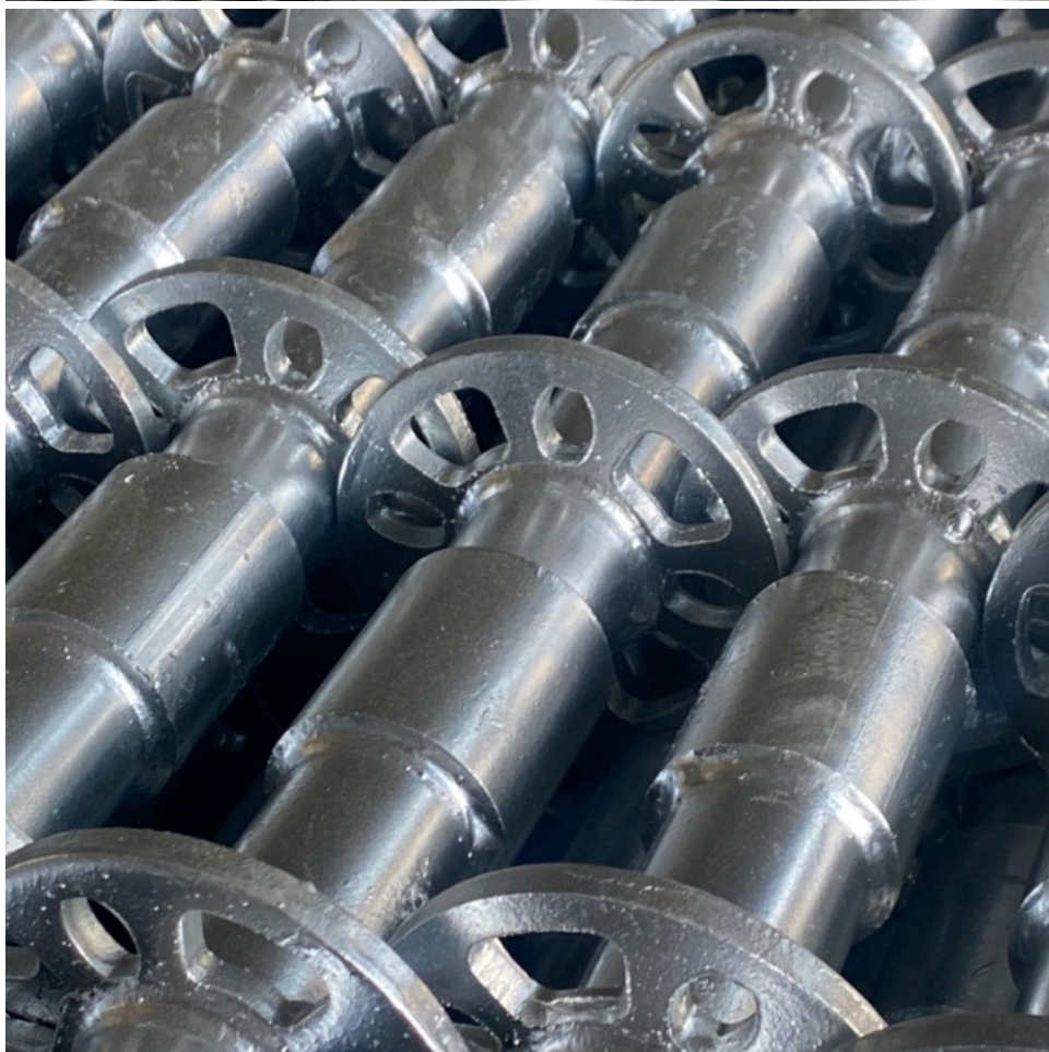
Warehouse & Loading